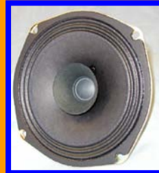
5 1/4", 6" or 8" PC $39.95ea