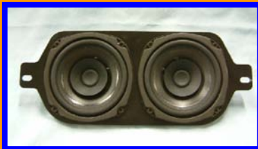
Mopar A, B Body Dual