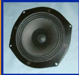
7" Mopar PC $49.95 ea