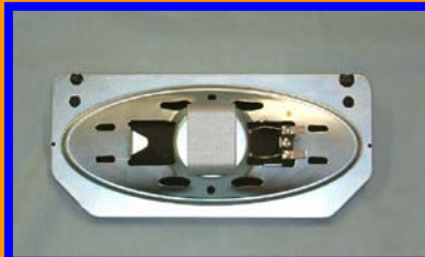
4x10" Special Rectangle $49.95ea