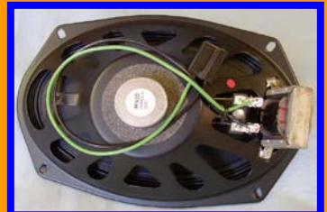
6x9" w/Load Coil $59.95 ea