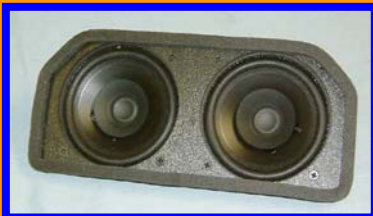
Dual 4x10 Special Rectangle