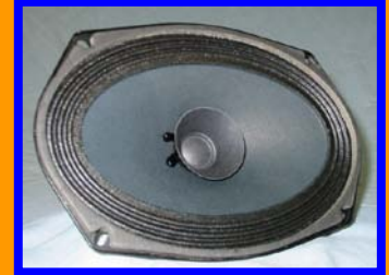
5x7" or 6x9" $39.95ea