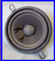
3 1/2" $68.95 pair

Our speakers are manufactured in the USA using compact high-energy neodymium magnets that allow these speakers to fit in tight locations often found on classic cars. Neodymium magnets are 1/10 the size and weight for the same magnetic field strength of the large round ceramic magnets found on modern replacement speakers. Available in most sizes required for 50's, 60's and early 70's applications. Most speakers are 8-10 ohm unless noted. All our speakers carry a 5 year full replacement warranty against manufacturing defects. Call us to order.