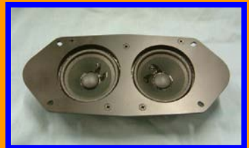
4x10 Oval - 3 1/2" Drivers

All sizes Dual speakers $79.95 4 1/2" drivers available in 4 or 8 ohm. 3 1/2" drivers available in 8 ohm only. Bass blocker capacitors installed on 3 1/2" dual speakers. All dual speakers shown without included fabric dust screens. Dual plates made from 1/4" ABS plastic or 11ga laser cut steel. Best sounding dual speakers made!