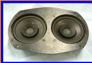
Dual 6x9 HQ