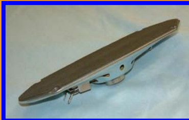
4x10" Slim-Line $39.95ea