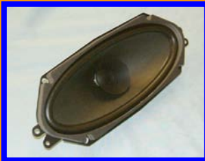
4x10" Universal $39.95 ea