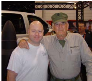
R. Lee Ermey