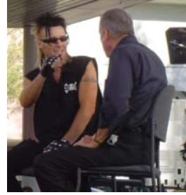
Billy the Exterminator