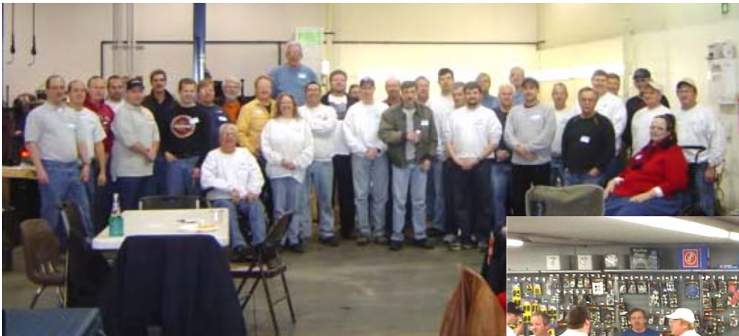
Bowtie Brunch 2010